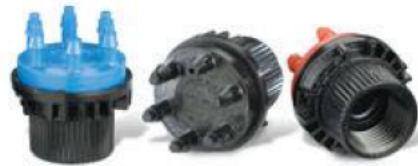
XBT-05-6, XBT-10-6, XBT-20-6