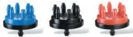
XB-05-6, XB-10-6, XB-20-6